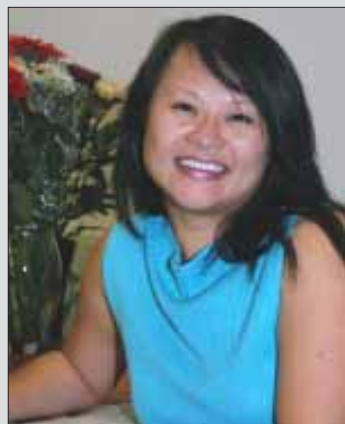
Anh Pearson Post Chapel

To always be a conscientious worker and love your neighbor as yourself.