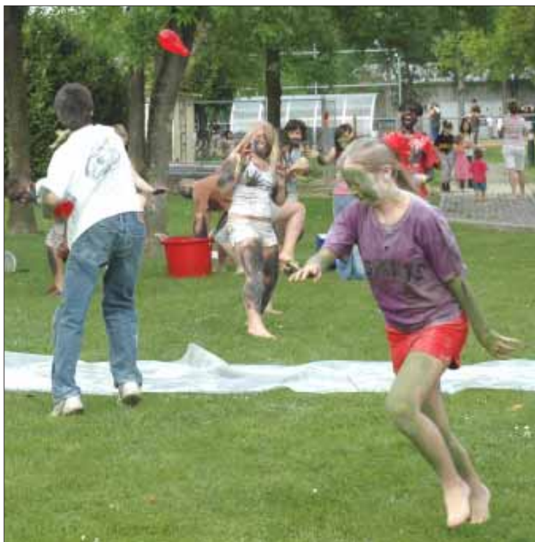
A member of the Tree Huggers team flings a water balloon at a member of Team Blue during the 5th Annual Club Beyond Muck Wars Saturday. The event was held in Villaggio and had local residents watching and laughing from the sidelines.